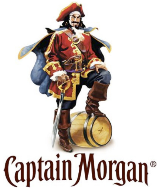
Figure 1. The patient is placed supine on a gurney, and the pelvis is fixed to a backboard with a strap. The patient's hip and knee are flexed to 90 degrees. The physician places one foot on the board, with a knee behind the patient's knee. The physician holds the patient's knee in flexion by holding the ankle down and applies an upward force to the hip by lifting with his or her calf and then gently rotates lower leg. Captain Morgan reproduced with permission from Diageo PLC.